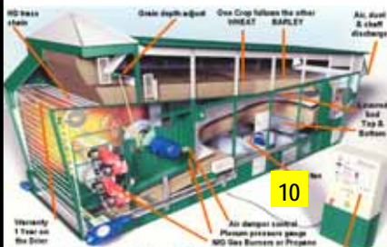
Models from 700 to 2200 bu/hr Control Panel & Moisture control STD